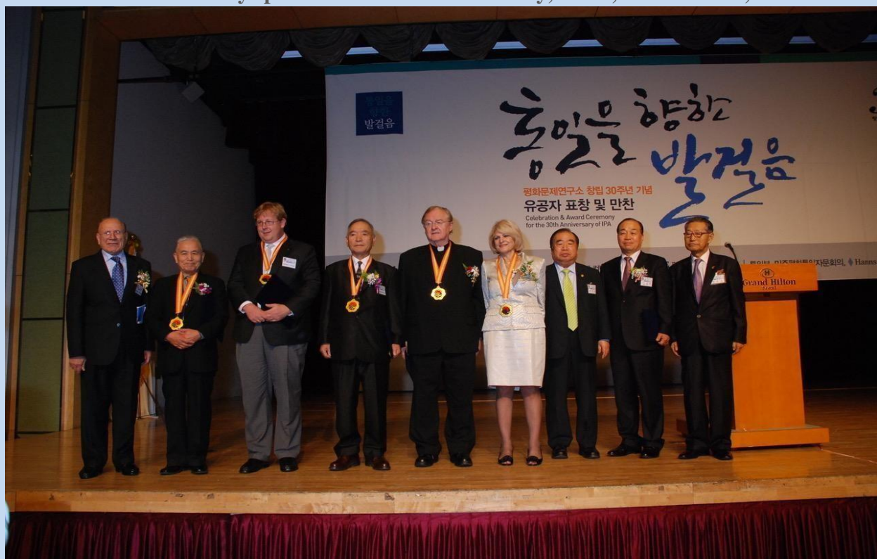
Induction Ceremony, Seoul, South Korea, 2013.